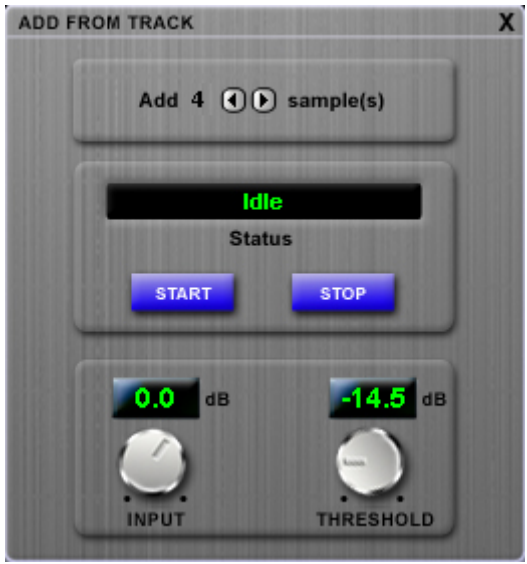
Fig. 22 - Add From Track Box

When it's done recording, the status display will change to "Recorded". You may need to adjust the Threshold and Input controls to achieve the proper triggering, however a setting of — 14.5 for the threshold, and 0dB for the input works well for most tracks. Please note that the audio track should be as noise free as possible. Processing the track with a gate is a good idea if noise is a problem.