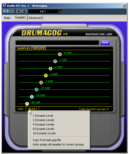
Fig. 28 - Reset Menu

Selecting the "Copy from last gog" option in the reset menu sets the dynamic groups to the same levels as the last gog file that was opened. This makes creating large numbers of gog files easier, since the dynamic levels can be copied from one gog to another without having to re-create them.