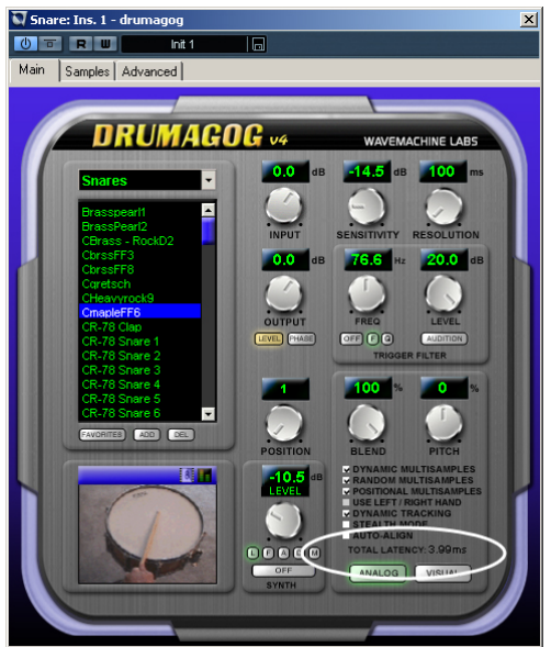
Fig. 30 - Total Latency