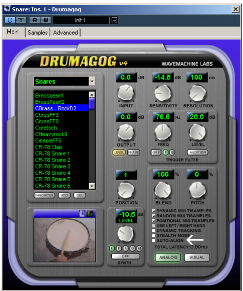
Fig. 2 - Auto Align

Moving the track back by the amount shown in Drumagog's "total latency" display solves any latency issues (if your audio program supports Auto Delay Compensation, this is done for you automatically).