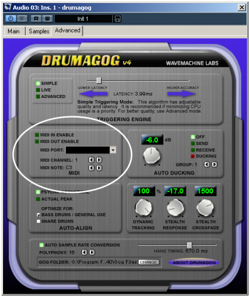
Fig. 29 - MIDI Settings

Drumagog's MIDI output implementation is different depending on which program you're using it in. Please see the appropriate section below.