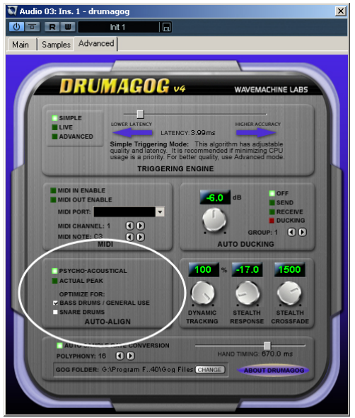
Fig. 35 - Auto-Align Options