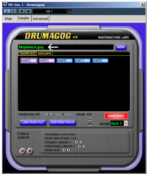
Fig. 25 - Naming a Gog File

A GOG file can be named (or renamed) by clicking in the edit box that contains the name of the file (see fig. 25). Note that renaming a GOG file actually makes a second copy of the file with the new name. If you wish to delete the first file, use the delete control in the Main page (right click on a gog file in the sample selection box and choose delete).