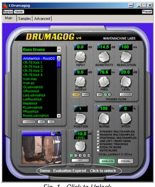
Fig. 1 - Click to Unlock

4. On Drumagog's graphics window, click on the text at the bottom that says "click to unlock" as shown below: