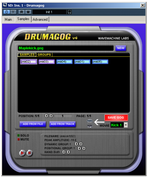
Fig. 23 - Recycle Bin

Removing a sample from the sample box is accomplished by dragging the sample into the recycle bin, located in the center of the samples page (see fig. 23). Deleting a sample from the sample box does not permanently delete it from the hard drive. Right-clicking on a sample also provides an option for deleting a sample.