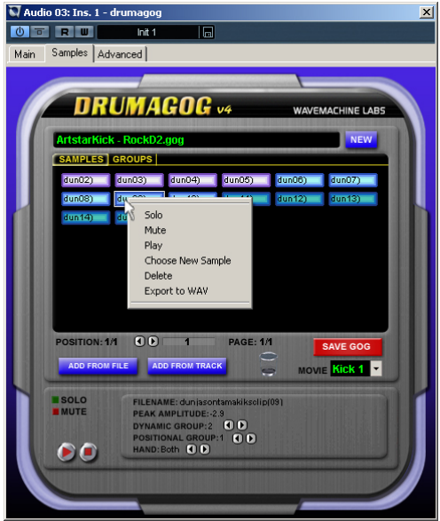
Fig. 24 - Right-clicking on a sample

By right-clicking (or control-clicking for Mac users) on a sample (see below) and selecting "choose new sample", a new file can be chosen for that particular sample. This is simply a time-saving function to be used instead of deleting a sample and adding a new one using "add from file".