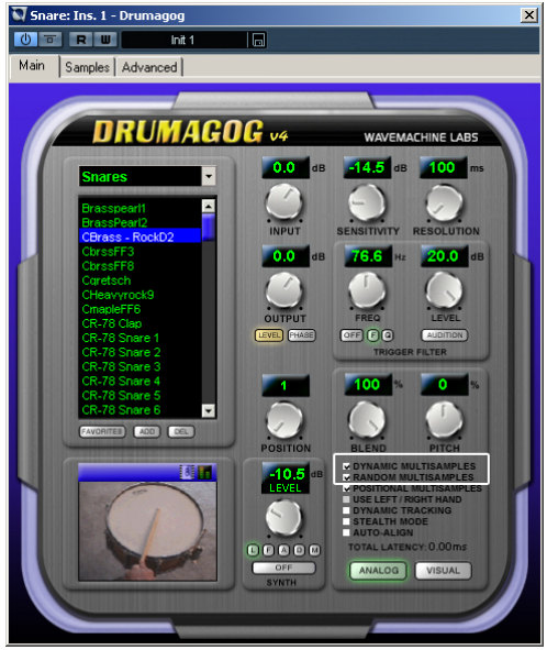
Fig.3 - Dynamic and Random Multisamples

A sample set that contains random multisamples is simply a set of samples that Drumagog can randomly pick from when replacing a drum. Random multisamples are often used in conjunction with dynamic multisamples to achieve the greatest level of acoustical accuracy. In the real world, when a drummer strikes a drum, it never sounds exactly the same, even if it's played in the same spot on the drum with the same force. The laws of physics guarantee this. For this reason, random multisamples provide variety in the replaced sound because Drumagog randomly chooses a different sample each and every time. Even amongst the randomized set of samples, the same sample will never be played twice in a row. When random multisamples are used, the resulting audio track doesn't sound like it came from a drum-machine. It starts to sound like the real thing. The ear is very good at recognizing when the same sample is played over and over. Random multisamples solve this problem.