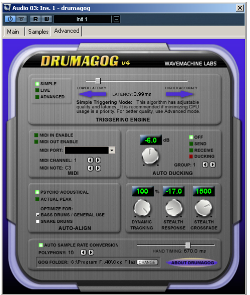
Fig. 43 – The Advanced Page