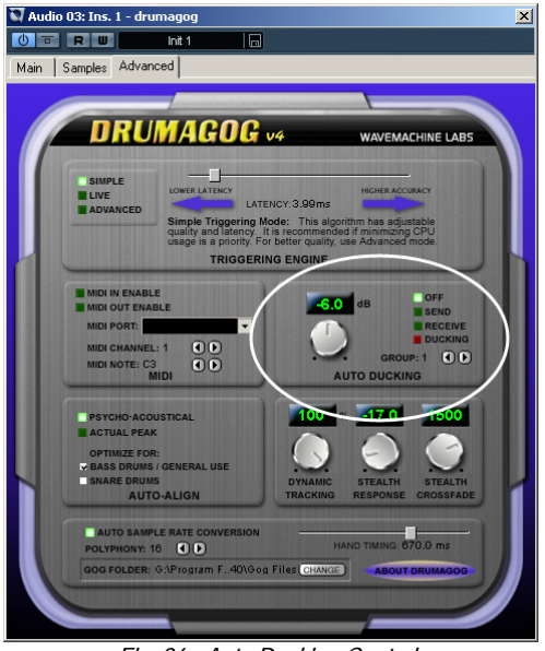
Fig. 36 - Auto Ducking Controls

Often it's not enough to just replace the drums on a track. Sometimes there are tracks that still contain bleed from the original drum. Auto-ducking can solve this problem. It's a feature used to "duck" audio in one track based on a trigger in another track. Auto-ducking is great for removing the snare drum from overhead tracks, or for quieting a loud hi-hat track. With auto-ducking, it is possible to remove virtually every trace of an old sound from a recording without damaging the tonality of the spillover tracks with destructive EQ. Several "ducking groups" are provided, so that, for example a snare could be removed from an overhead track at the same time a kick drum is removed from a tom track. The two would use different groups. The auto-ducking controls are located in the Advanced page (see fig. 36). To use it, follow these simple steps: