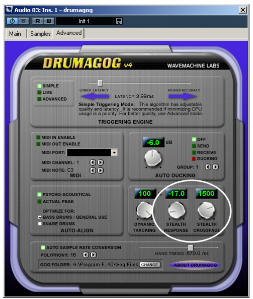
Fig.39 - Stealth Mode Controls

Stealth Crossfade adjusts how long Stealth Mode takes to crossfade the original track back in, after the replaced drum hit is played. On tracks with very long-decaying drum hits, choose a larger number, so that none of the original sound is heard. A value of 95 works well in most cases