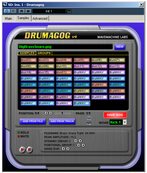
Fig. 42 - The Samples Page