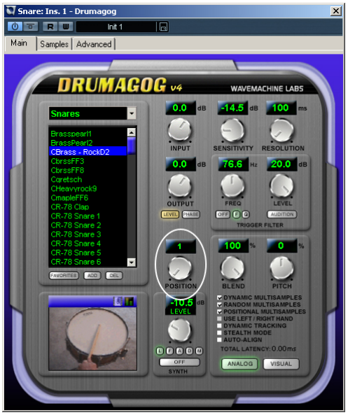
Fig. 4 - Position Control

Positional multisamples add a completely new dimension to the sample set. A positional multi-sample set contains a separate sample (or group of samples) for every stick position with which a drum can be played. For example, a snare sample set might contain 3 positional groups – one for the drum being played in the center, one off the side, and one for a rim shot hit. A ride cymbal might use positions from the outer rim of the cymbal to the bell. A hi-hat positional sample set could have the positions represent the various foot-petal positions (open to closed). By adjusting the position control, these various positions can be controlled in real-time.