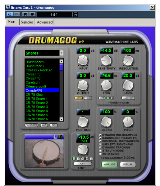
Fig. 41 - The Main Page