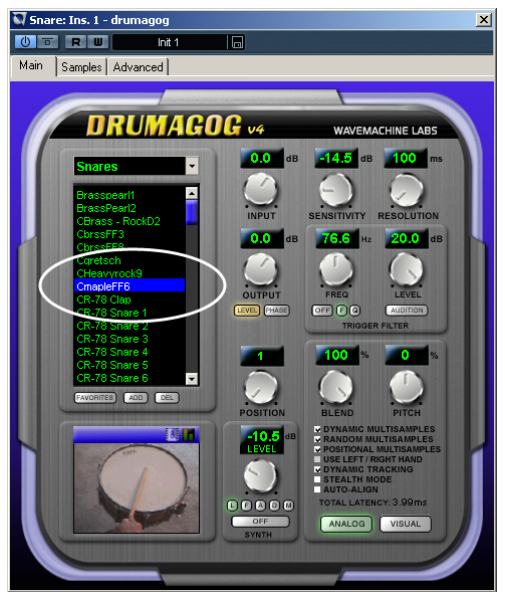
Fig. 9 – The Sample Selection Box