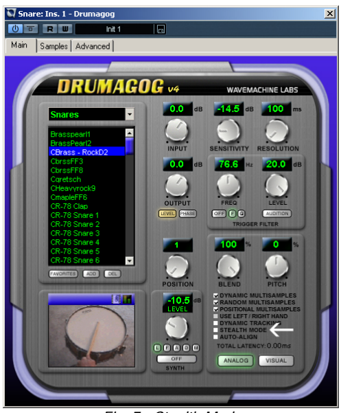
Fig. 7 - Stealth Mode

Drumagog introduces a feature called Stealth Mode . This powerful feature passes all the original audio through unchanged until the trigger threshold is reached. Stealth mode is especially useful in tracks that contain both a snare and a hi-hat on the same track. Drumagog will pass the hi-hat through, quickly crossfade into the replaced snare sample when the snare drum is heard, then crossfade back into the hi-hat again. To use Stealth mode , enable it by clicking on its checkbox located in the Main page. The Advanced page also contains two controls for adjusting how stealth mode operates. These are discussed in the Advanced Techniques section.