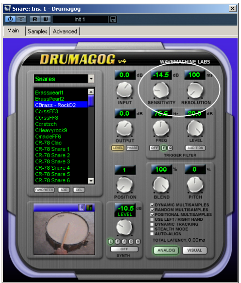
Fig. 11 - Adjusting the Sensitivity and Resolution

the main page. In the visual triggering box, your drum track will scroll from right to left, while the sensitivity and resolution controls remain superimposed on top of the audio. Adjusting the sensitivity is as easy as clicking on the horizontal line with the mouse, and dragging it up and down. When Drumagog triggers on a drum hit, the corresponding audio will have a white dot on top of its peak in the waveform. In most cases, the resolution should be left at 100ms (or "Auto" if using advanced triggering), however if the drum track you're working with is noisy, you may want to increase this so Drumagog won't falsely trigger. This is done by moving the resolution line right to left. When you are done adjusting using visual triggering, click the "Analog" button to return to the normal screen. For more information about visual triggering, please see chapter 6.