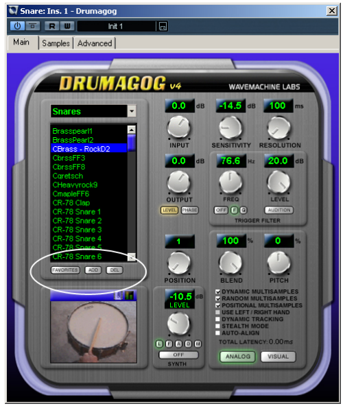
Fig. 6 - Favorites

Drumagog can remember a list of your favorite samples. To add a sample to the favorites list, select a sample, then click the add button under the sample selection box. You can switch between samples and favorites by pressing the "Fav" button. Pressing "Del" removes a sample from the favorites list. Note: removing a sample from the favorites list does not actually delete the file; it simply removes it from the list of favorites. Note: the favorites feature is not available in Drumagog Basic or Drumagog BFD.