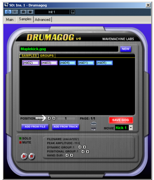
Fig. 15 - Positional Page Buttons

A gog file can also be divided into several positional groups. A positional group is a group of samples representing a drum hit at a particular position (for example, the rim of the drum, or the center). The samples page divides positional groups into several "pages", which can be selected by clicking the position arrows under the sample box (see below).