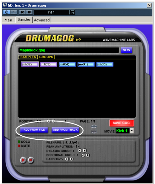
Fig. 20 - Add From File and Add From Track

To add samples to a gog file, Drumagog provides two choices: adding a file (such as a WAV, AIF or SDII file), or adding a sample directly from the audio track Drumagog is inserted on.