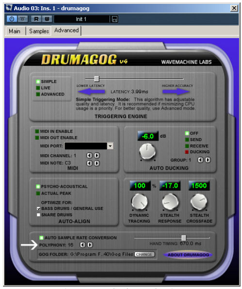
Fig. 37 - Polyphony Settings