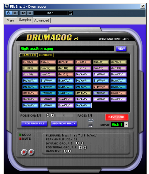
Fig. 14 - The Samples Page

The samples page is used to edit the currently loaded GOG file, or to create your own GOG files. Although Drumagog can use several sample formats, including WAV, AIF, and SDII, the real fun begins when using Drumagog own GOG format. A GOG file can contain up to 384 individual samples, arranged into three groups (dynamic, positional and hand).