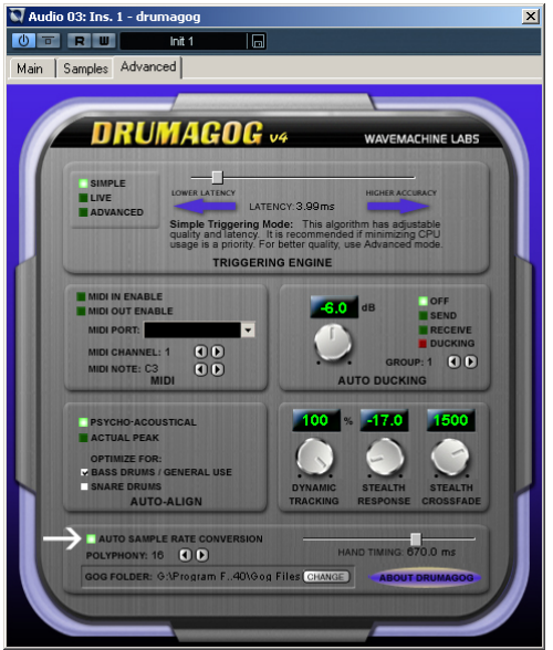
Fig. 38 - Sample Rate Conversion