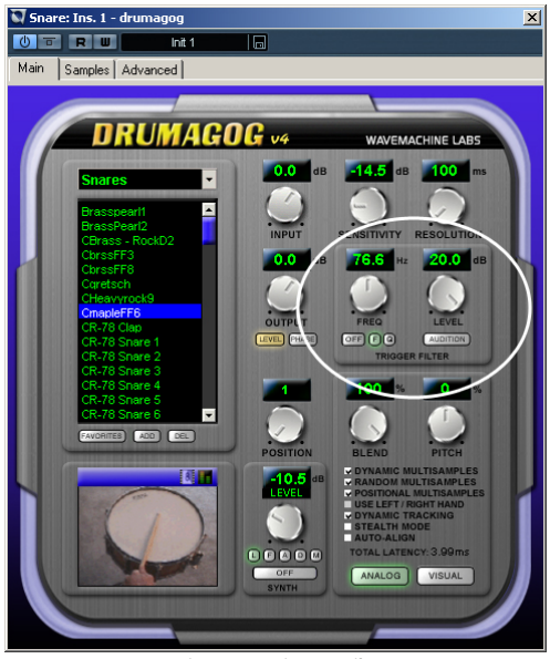
Fig. 33 - Trigger Filter

Most drum tracks are easy to replace, but on occasion there may be excessive bleed from other instruments, which cause problems when triggering. Drumagog contains a trigger filter for use in these cases. This filter, located on the main page enables you to fine-tune the frequency range of interest, making the desired drum easier for Drumagog to replace. Drumagog's trigger filter has four modes: hipass, low-pass, bandpass and notch.