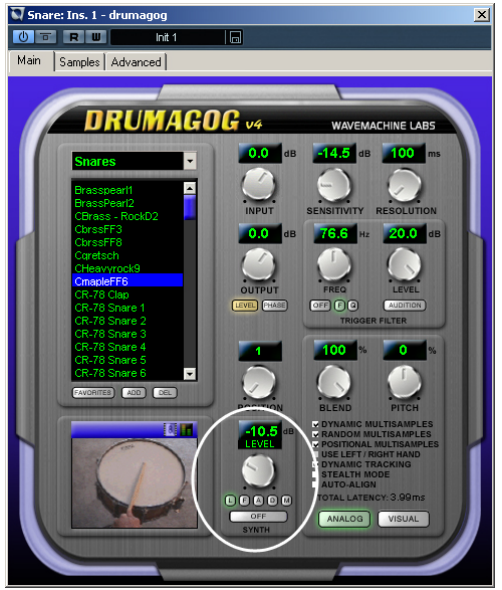
Fig. 34 - Synth

The "M" button enables adjustment of the overall synth mix. Setting the control between 0% and 100% adjusts the mix of synth to sample audio.