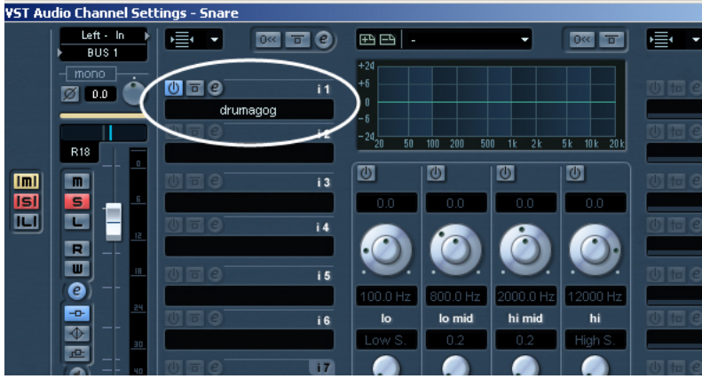
Fig. 8 - Inserting Drumagog on an audio track