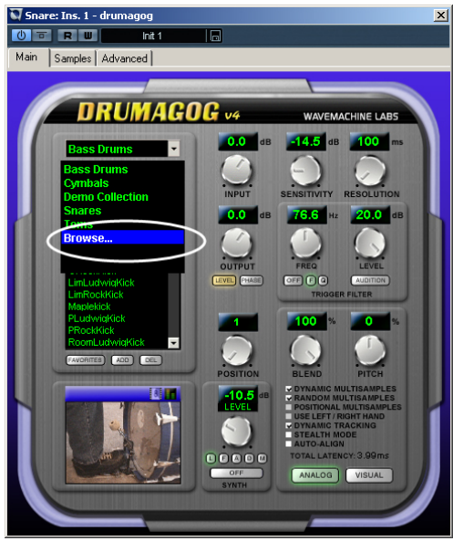
Fig. 5 - Choosing your own samples

In addition to using the included gog samples, you can easily use your own WAV, AIF, SDII and SND files. To load your own sample, choose "Browse" (shown in fig. 5) from the folder selection box and choose a sample.