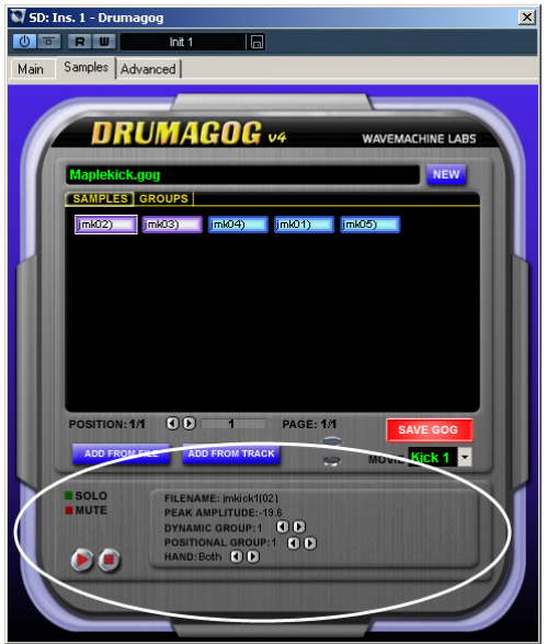
Fig. 19 - The Sample Properties Box