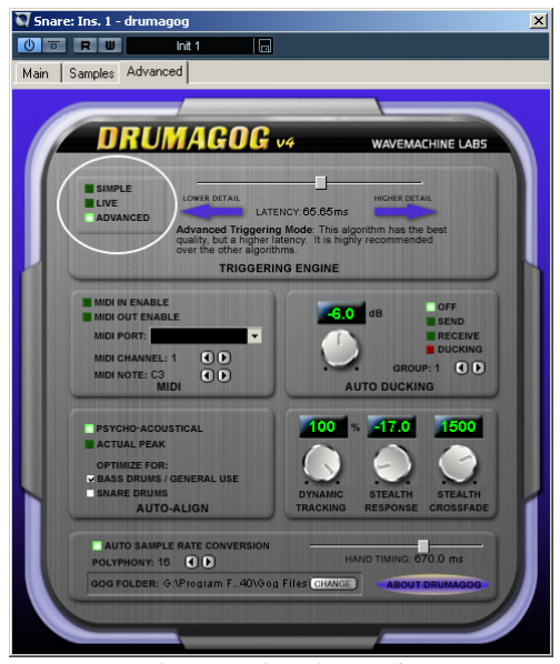
Fig. 10 - Triggering Modes

Live Triggering Mode introduces no delay (zero latency), but it has lower accuracy in terms of dynamics. It is only recommended if using Drumagog at a live show (running on a laptop, plugged into the main board, for example). It is therefore not recommended for general use.