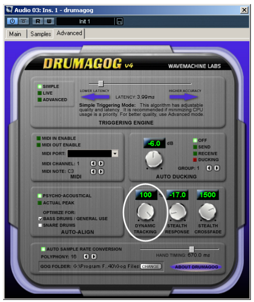
Fig. 40 - Dynamic Tracking Control

Normally, 100% is used. Changing dynamic tracking to a value other than 100% is an effective means to control overly dynamic tracks without the artifacts imparted by traditional compression. It also works well "upstream" from a compressor, when the compressed effect is desired, but not at the level required to achieve the desired dynamic control.